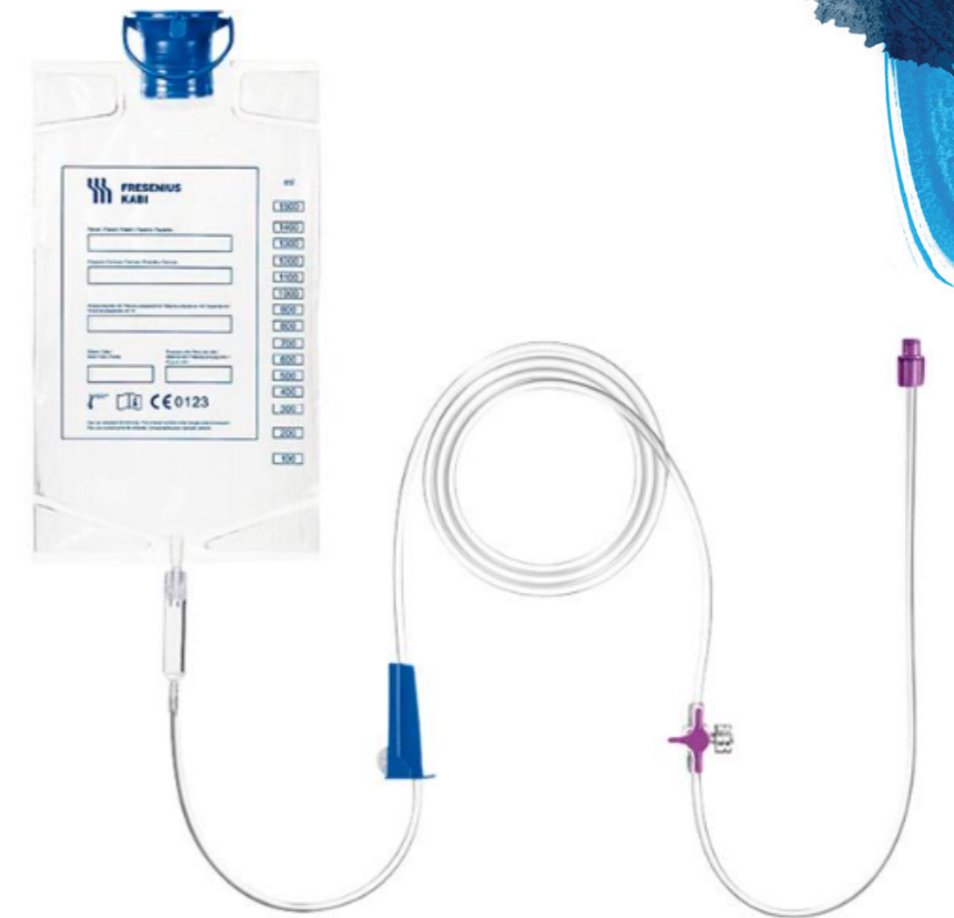
GraviSet Bag, ENFit (7751938)