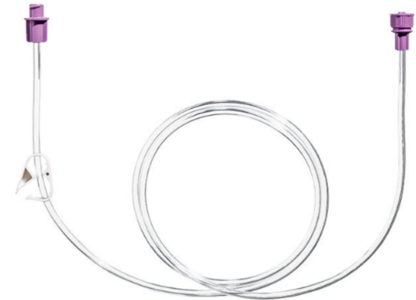
Enteral Giving Set Extension (7755693)